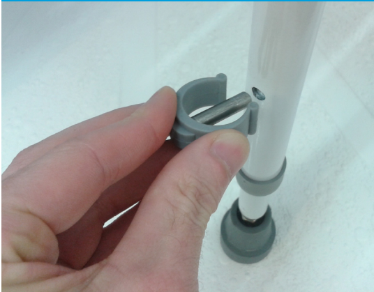
Remove 'e' clip to adjust the leg height.