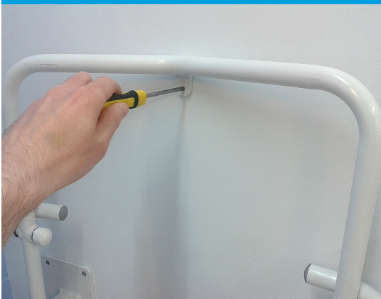
Fix the frames lug to the wall using a suitable fixing.

TESTING Check the movement of the seat once installed by raising the seat from the down to the up position.