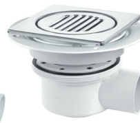
TSG52 Square Tile Gully