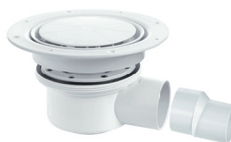
TSG52 Standard Vinyl Gully