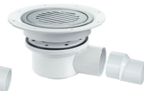
TSG52 Round Vinyl Gully